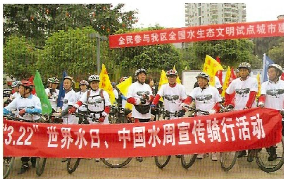
Cycling to celebrate the World Water Day and the China Water Week

China represents a unique case in terms of its national conditions in general and its water regime in particular. To tackle its complex water challenges, the country needs not just a solid engineering foundation and support of advanced technologies, but also and more importantly a robust institutional framework. The most daunting challenge confronting the current water regime is the failure of water resources, as a factor of production, to force a shift in the pattern