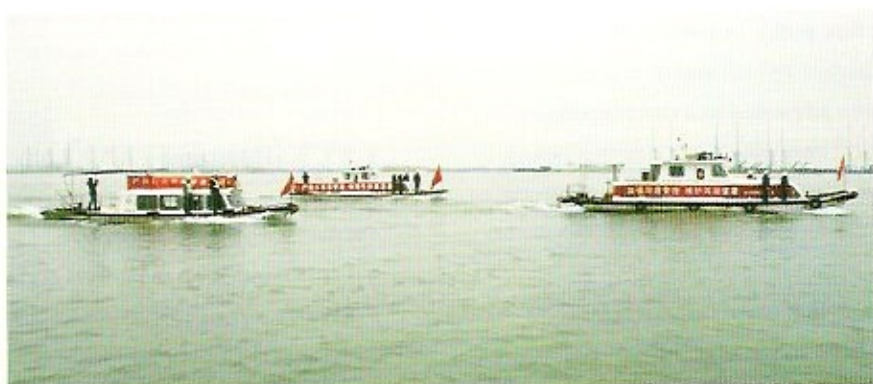
Law enforcement activities

of economic growth. The potential of water pricing in improving resource allocation, conservation and protection has yet to be fully tapped. More needs to be done to motivate all segments of the society to invest in the development of water infrastructure. The way in which society is run remains inadequate to afford effective protection to water ecology and environment. The system governing the development of farmland water conservancy is incompatible with shifts in the mode of agricultural operations. The PRC Ministry of Water Resources has promulgated the Implementation Opinions on All-round Enhancement of Rule-of-Law Water Governance and Management , explicitly providing for the need to construct a sound regulatory framework for water resources, which would include a comprehensive water law system, an effective enforcement system based on rule of law, a stringent supervision system for rule-of-law water management, and a strong assurance system for rule of law in the water sector.