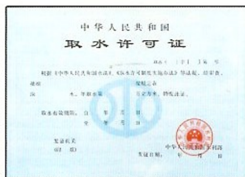
Water Abstraction License issued by the government