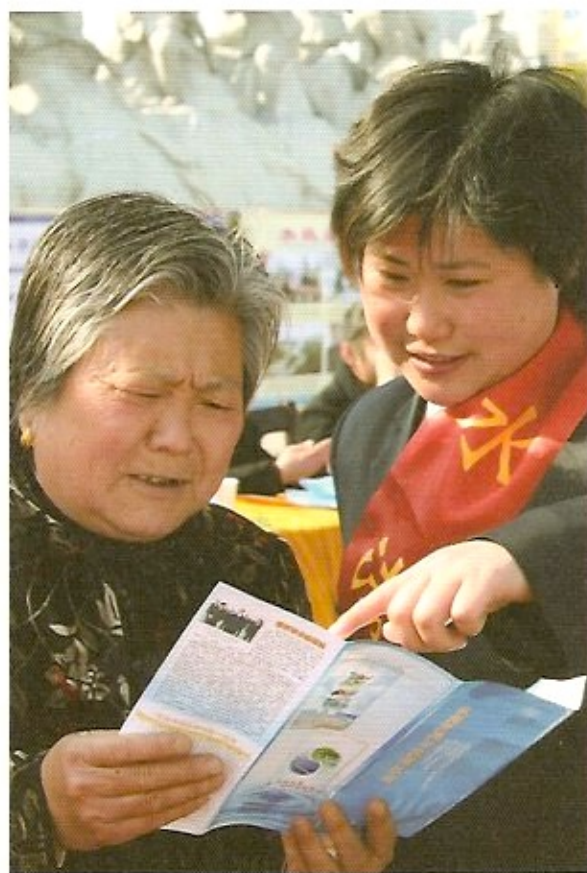
Promoting knowledge of water-related laws among the public

Since 1949, remarkable strides have been made in the development of water policies and regulations. The rollout of a significant number of water policies and regulations over time has resulted in an increasingly sophisticated legal framework on water resources. China has so far managed to put in place a fairly robust water law system that consists of, among others, 4 pieces of legislation, 19 pieces of administrative regulations, 55 ministerial rules and 700 or so sub-national regulations and government rules.