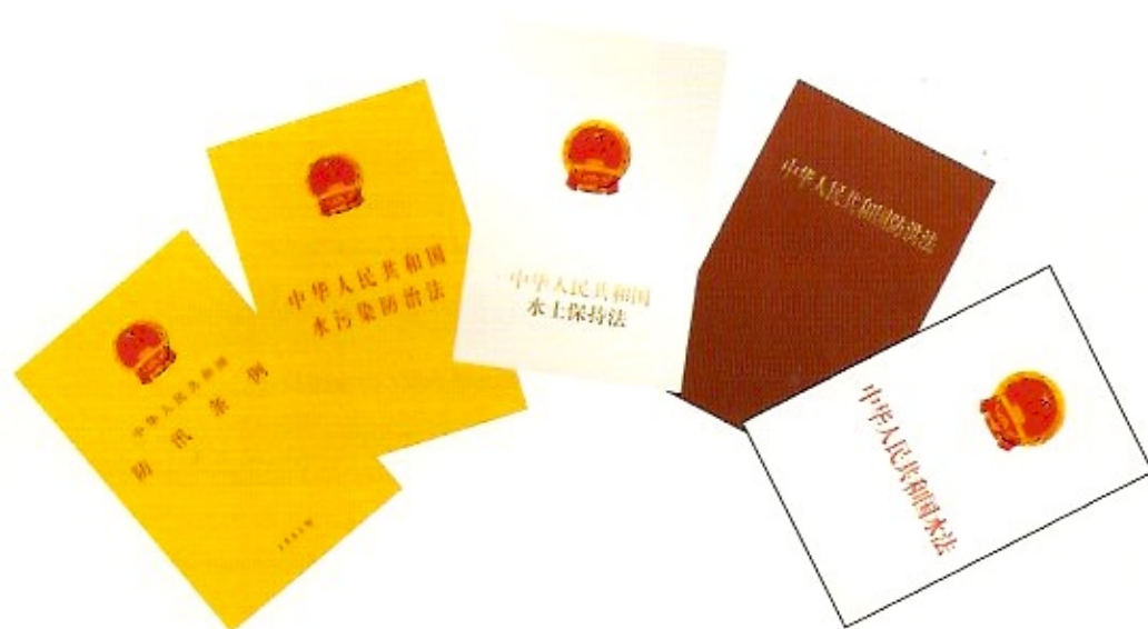
Some water-related laws and regulations promulgated in China

The existing legal framework governing water management is composed of the following: