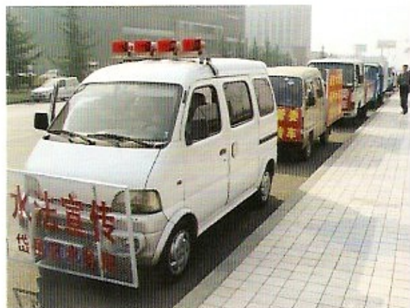
Water regulations publicity campaigns